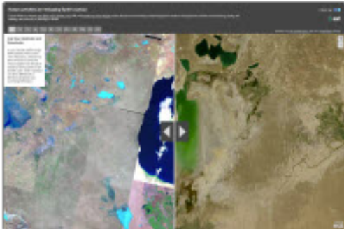
Landsat Series: Human activities are reshaping

Story Maps are part of the ArcGIS Online mapping platform. This online platform provides web-based tools to combine an interactive map with text and multimedia elements including video , audio & images to tell a story.