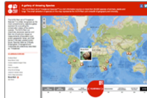
IUCN Amazing Species