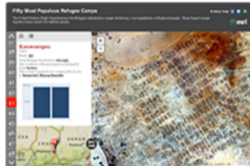
Fifty Most Populous Refugee Camps